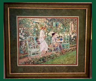
5. Framed Frieseke print, "Lilies"