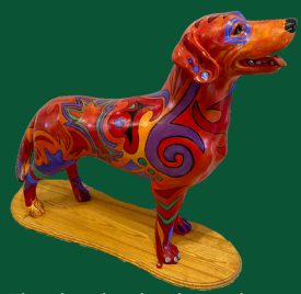
7. Fiberglass dogs handpainted by Linda Ruehle