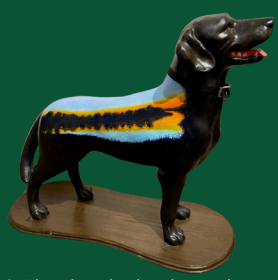
8. Fiberglass dog handpainted by Tom Tomasek