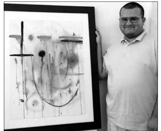
Devon Hill of Owosso, untitled watercolor